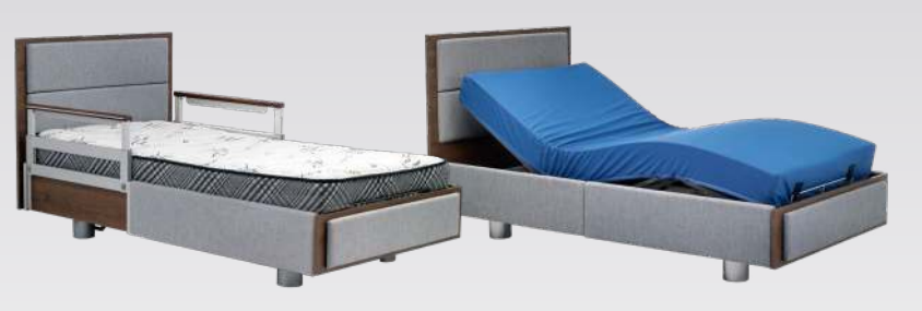
Shown with two rails and Dream™ Mattress