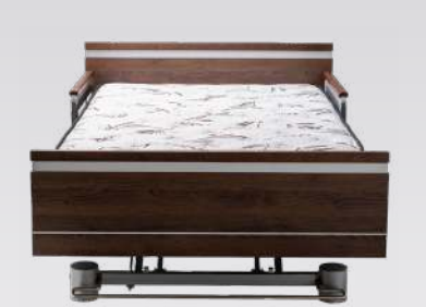
Aura™ Premium Extra Wide 48" with Dream™ Mattress