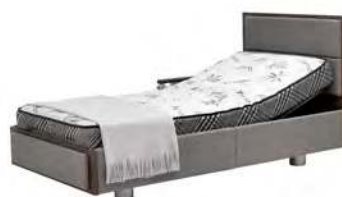
Non-institutional, elegant design

The adjustable mattress deck height provides support while getting in and out of bed, customizable to the height and preference of the user.