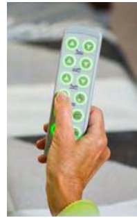
Illuminating hand controller

Each section of the frame can be easily removed for thorough cleaning.